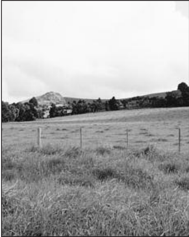
The original Kelly block at Beveridge where Ned was born in a long-vanished house.