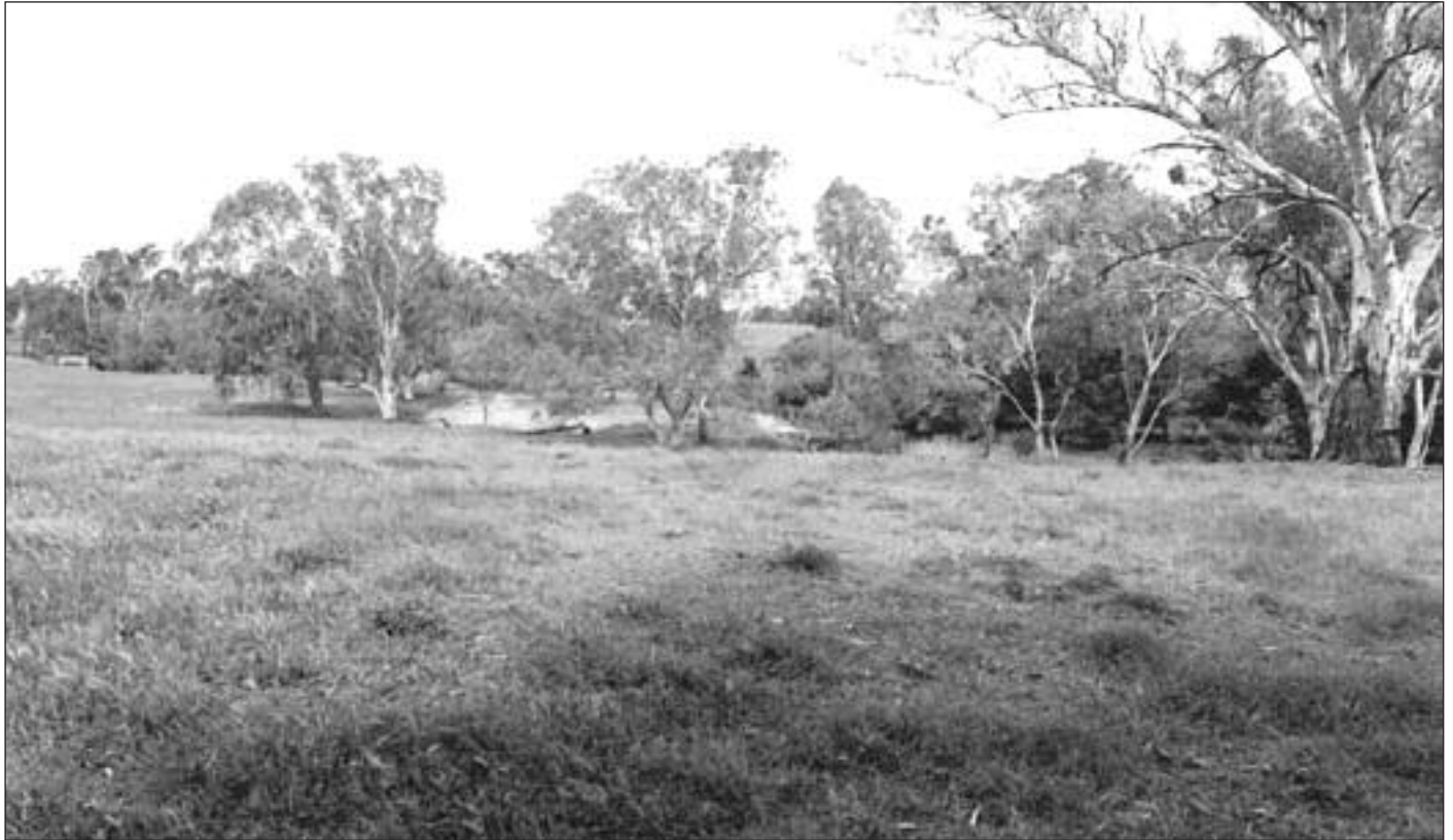
Site of the Kelly House on Hughes Creek near Avenel