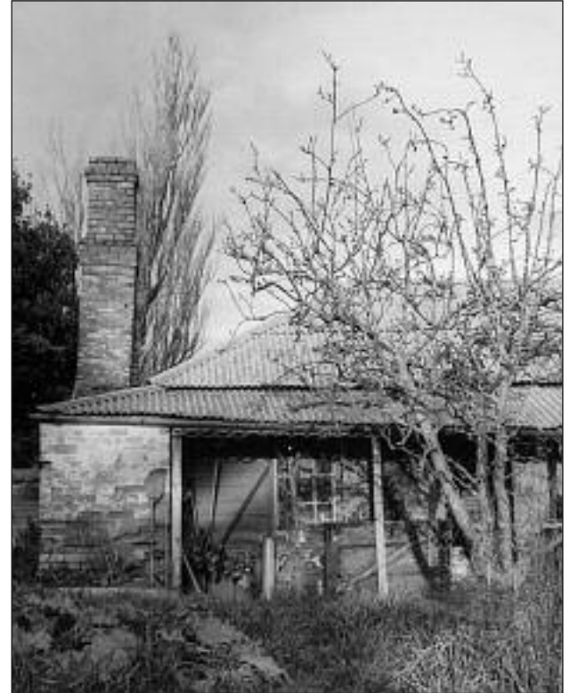
The Quinn Homestead , Wallan, photographed in 1964.